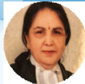
Justice Gyan Sudha Mishra Political Science Hons. 1965-68 batch First Woman Chief Justice of Jharkhand High Court Only Woman Judge of Supreme Court from Bihar and Jharkhand