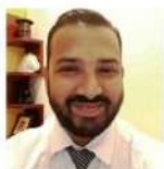
Assistant Professor, Patna Women's College