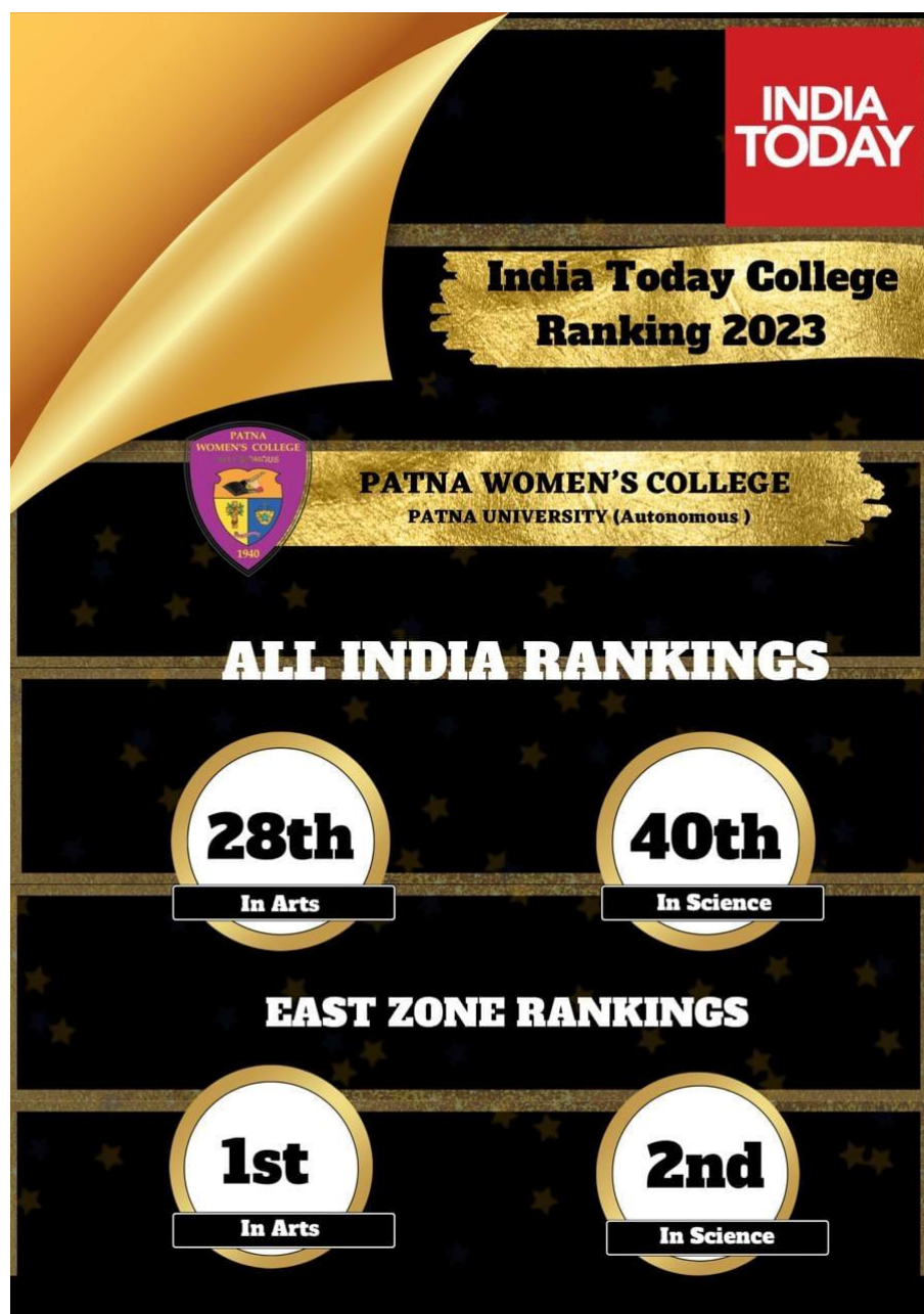
Poster of MDRA India Today 2023 Rankings of Patna Women's College