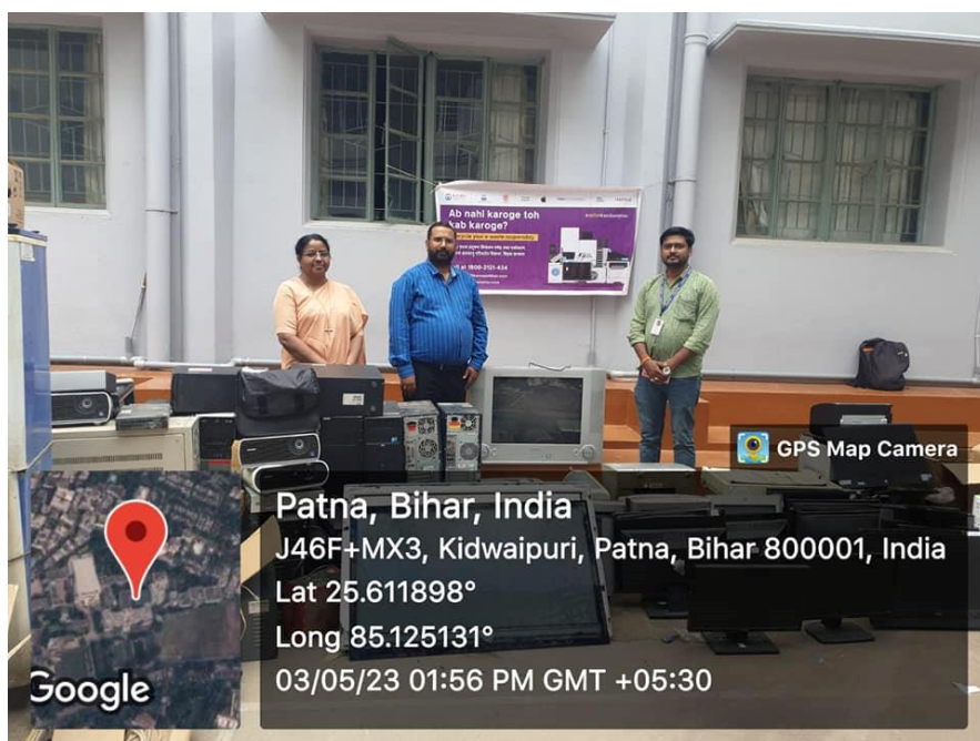
Handing over the e-waste of the College to Karo Shambhav organisation