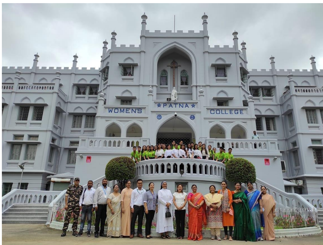
The visiting students and teachers from Mizoram at Patna Women's College campus