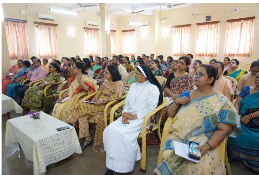
Participants of the Research Workshop on "What, How and Why of Paradigmatic Research"