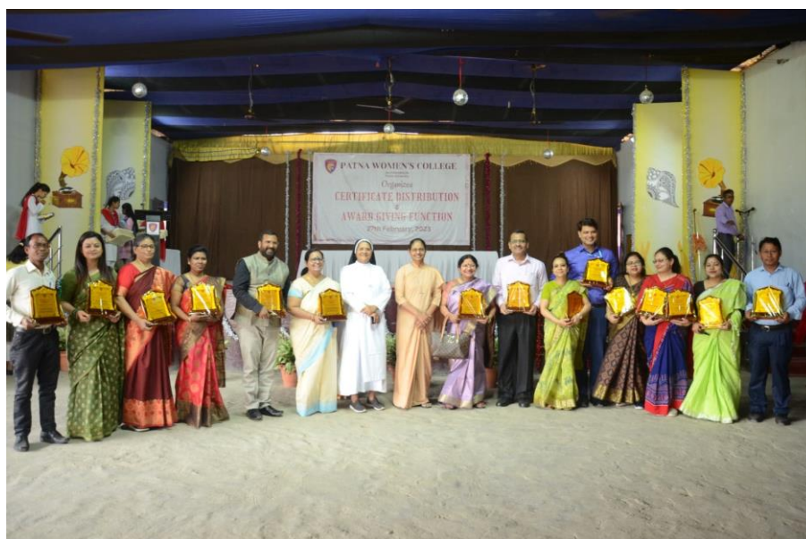
The Teachers and Staff members with their Awards

AWARD Ceremony 2023 at Patna Women's College: A special award function was organised at Patna Women's College on 27.02.2023 to acknowledge and reward the sincere service rendered in different fields by the faculty members and staffs.