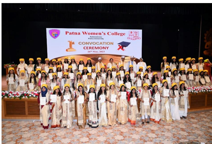
The Graduating students with their Degree Certificate