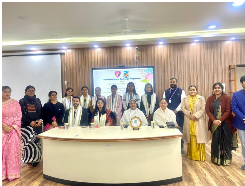
The visiting team from Sophia Girls College, Ajmer along with the Principal, Vice Principal and teachers of Patna Women's College