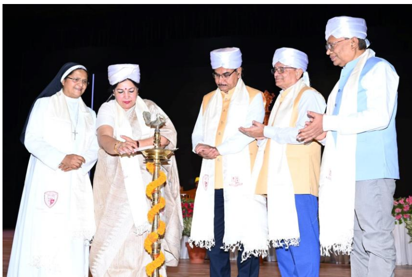
The Dignitaries inaugurating the Convocation Ceremony on 23 rd May, 2023